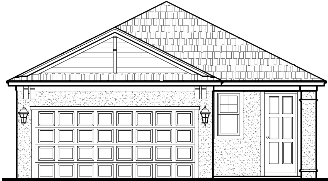
COASTAL ELEVATION - A